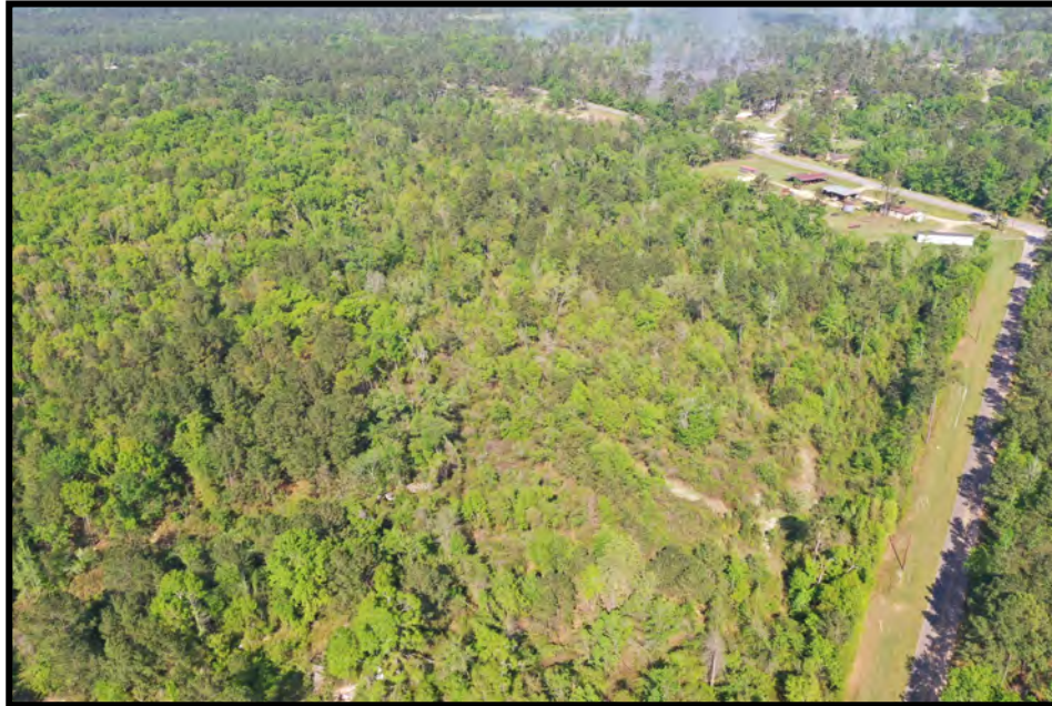
Top Photo Facing North NE Hwy 97, Horseshoe Bend Rd. Bottom Photo Facing SW at Corner of Horseshoe Bend Rd. and Old Southland Road.